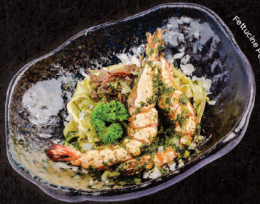
Fettuccine Pesto Sauce & Tiger

STREAMED SEABASS WITH LIME AND CHILI SAUCE + CHARCOAL-BOILED PORK NECK + MASON YOUNG COCONUT COMBO SET PRICED AT THB 950++ (REGULAR PRICE THB 1,060++)