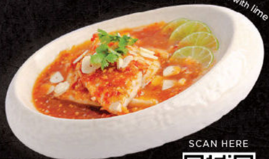
Steamed Seabass with lime