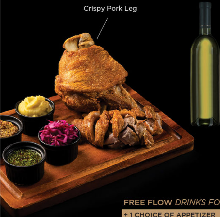
Crispy Pork Leg